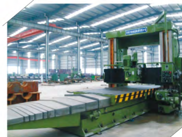
龙门铣床 Gantry Boring And Milling Machine