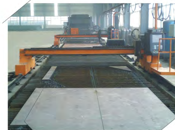
数控等离子切割机 CNC Plasma Cutting Machine