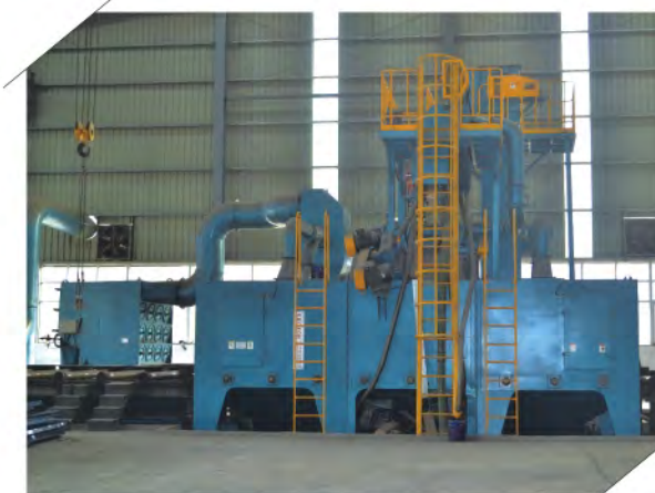
抛丸机 Shot Blasting Machine