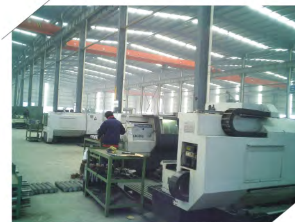
数控加工区 CNC Processing Area