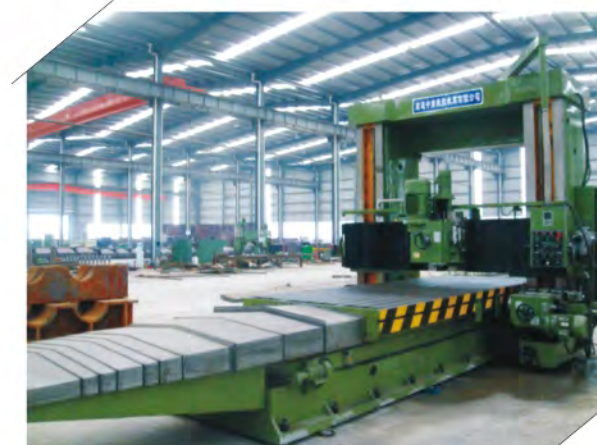
龙门铣床 Gantry Boring And Milling Machine