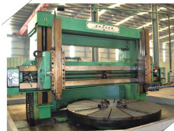
大型立车 Heavy Duty Vertical Lathe