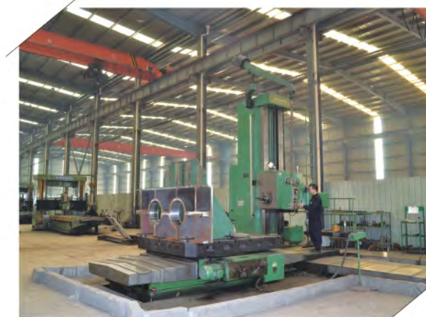
数显落地铣镗床 Significant Number Of Boring And Milling Machine