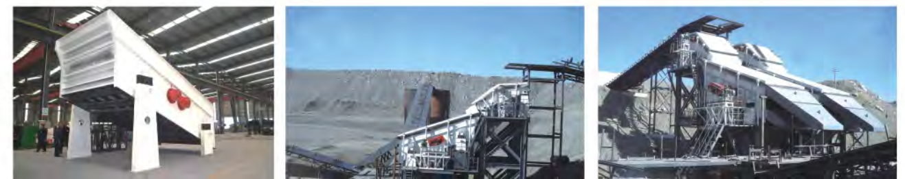
新疆圣雄黑山煤矿安装现场 Xinjiang shengxiong Heishan Coal mine installation site