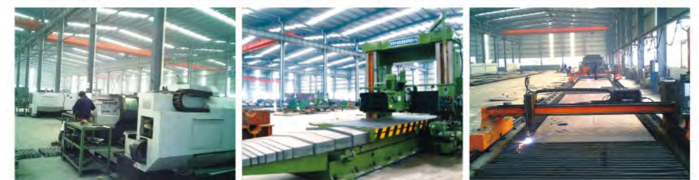
数控加工区 CNC Processing Area 龙门铣床 Gantry Boring And 数控等离子切割机 NC Plasma Cutting Machine