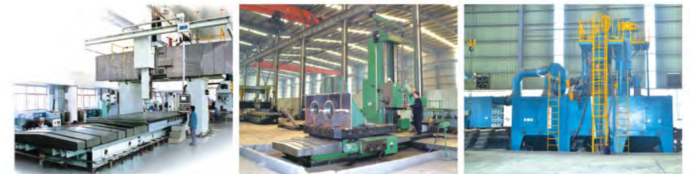
龙门镗床 Gantry Boring Machine 数显落地铣镗床 Significant Number Of Boring And Milling Machine 抛丸机 Shot Blasting Machine