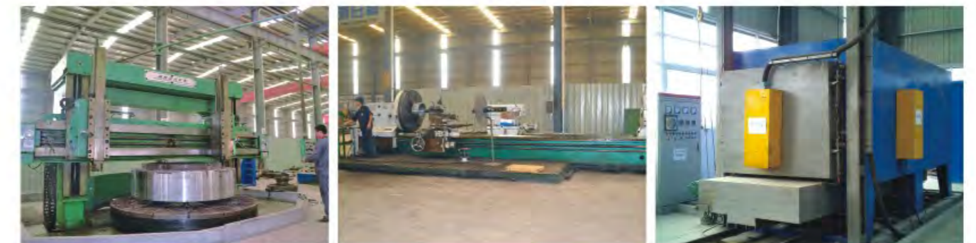
大型立车 Heavy Duty Vertical Lathe 大型卧式车床 Large Horizontal Lathe 大型热处理设备 Large-scale Heat Treatment Equipment