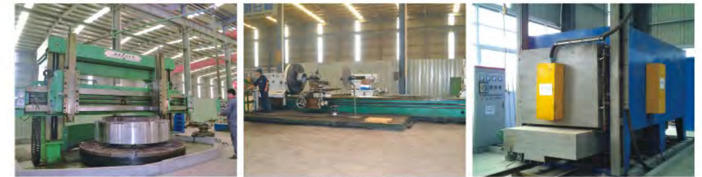
大型立车 Heavy Duty Vertical Lathe