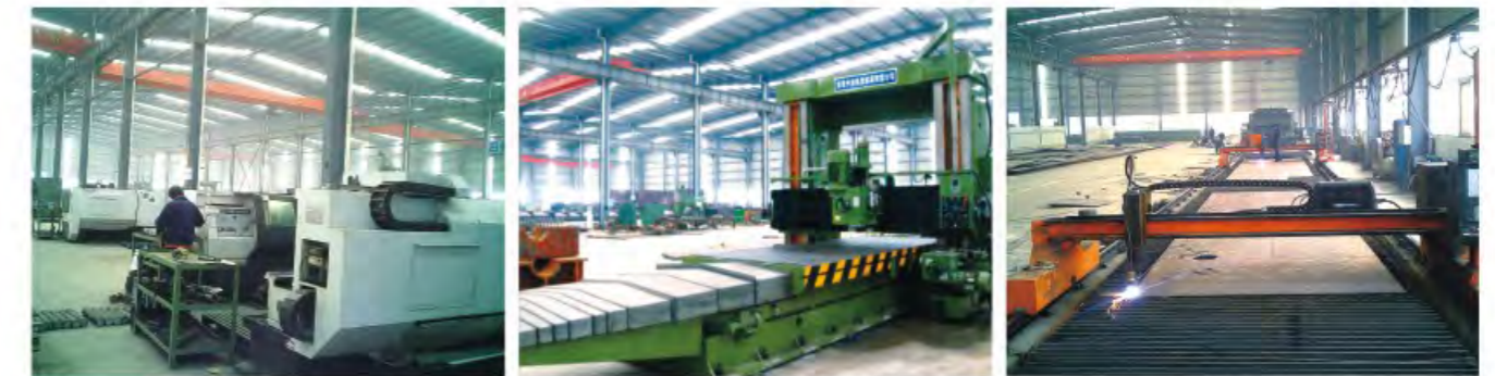
数控加工区 CNC Processing Area